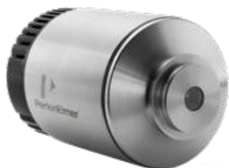
DA 7350 In-line NIR Instrument