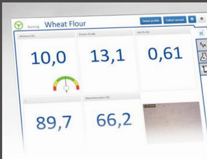
INTUITIVE GRAPHICAL USER INTERFACE