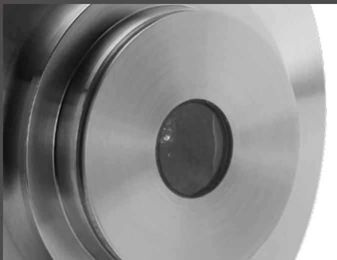
MODERN NIR INSTRUMENT COMBINED WITH CAMERA