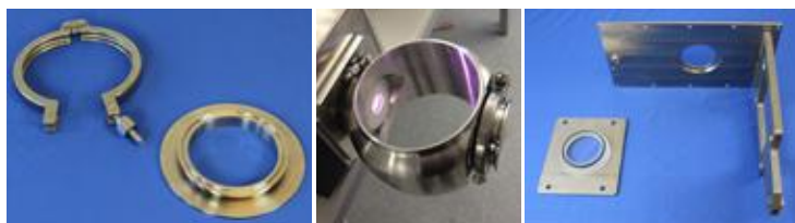
1. Mounting Flange

3. Mounting Panel is a flexible and easy-to-use mounting option for conveyors and other flat surfaces.