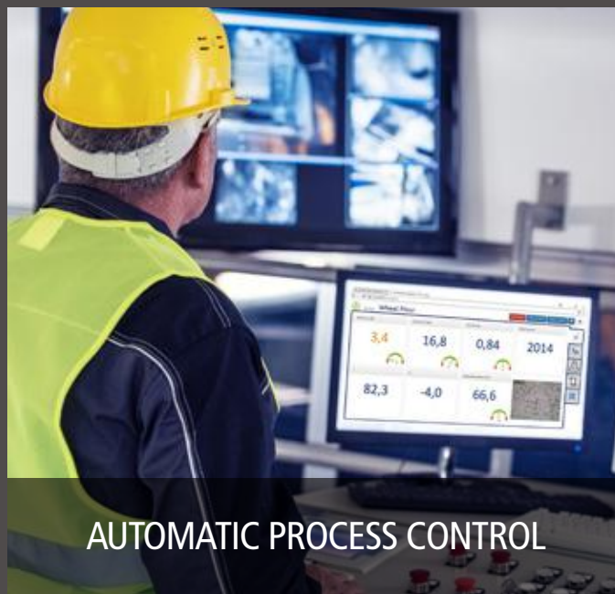
AUTOMATIC PROCESS CONTROL